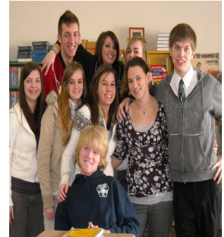
The Class of 2009

As we define our own worldview and begin to understand others, we become like the men of Issachar in I Chronicles 12:32, who "understood the times and knew what Israel should do." (NIV) At FCVCS we want to understand our culture, know what to do, and be actively involved in change.