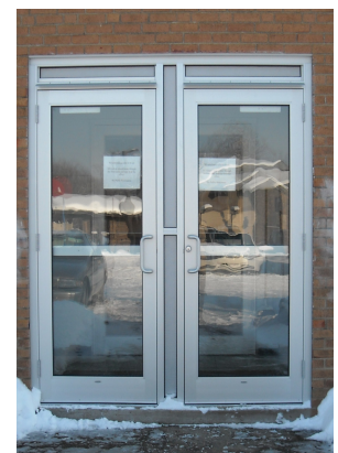
The west end doors

We are very grateful for the added security and insulation provided by the new doors.