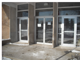
The new front doors!

during the school day so that visitors may only enter through the front door clos-